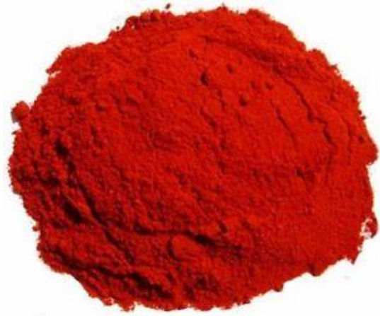
Allura red E127