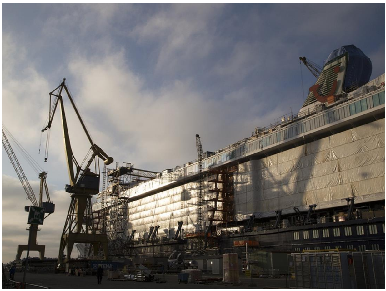
Meyer Turku shipyard is currently building cruise ships for TUI Cruise